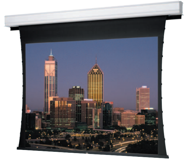
All fabrics will be seamless.

Dual motors with one operating the door and one operating the screen.